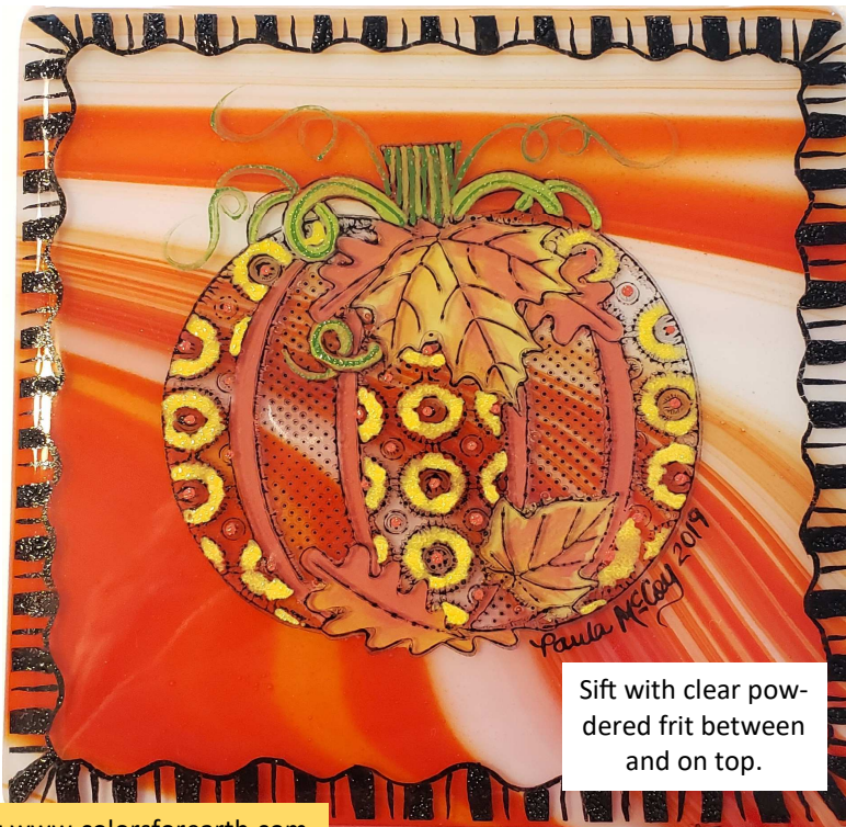
Sift with clear powdered frit between and on top.