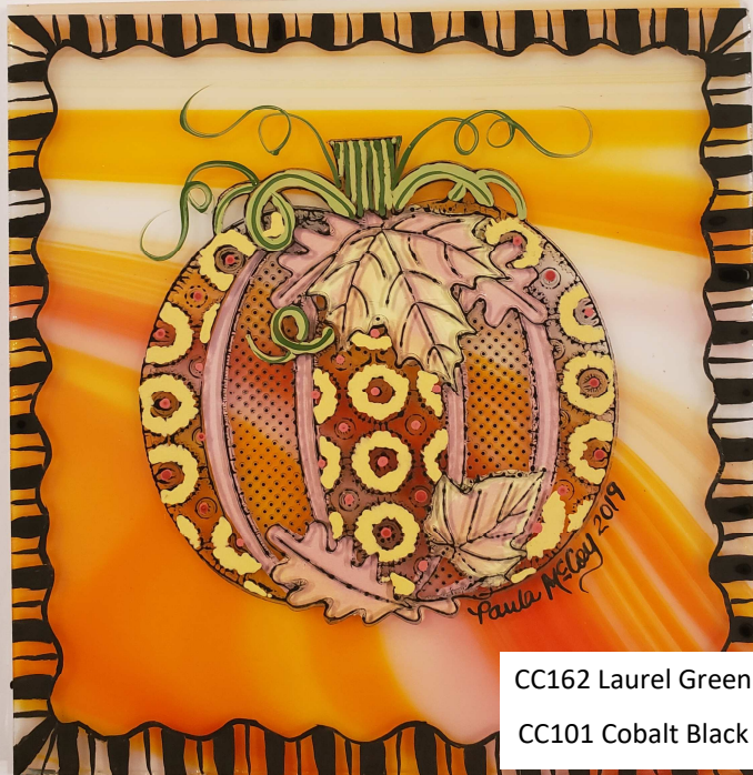
CC162 Laurel Green CC101 Cobalt Black