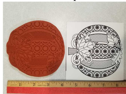
ST26 The Great Pumpkin Stamp