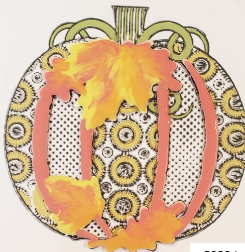
G322 Lemon Peel G318 Pumpkin G310 Vermillion