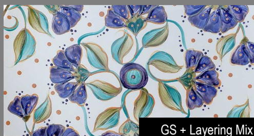
GS + Layering Mix