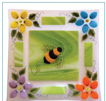
COE96 Fusible Bumble Bee

Jubilee Creative 877-845-6300 customerservice@jubileecreative.com www.jubileecreative.com