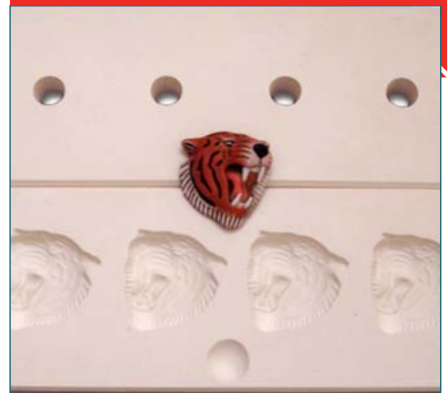
Sutton Mold #86 - Mascot Molds

Colors for Earth: www.colorsforearth.com iLoveToCreate: www.ilovetocreate.com