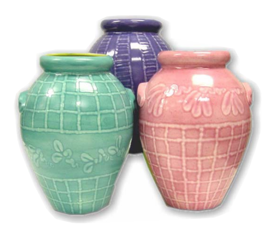
Diffusion with Gizmo and brush over a tinted PSB glaze.