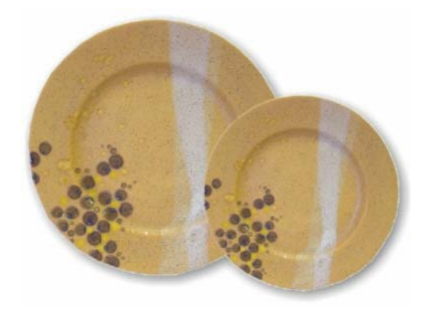
Tinted PSB base glaze with white tinted PSB stripes. Clear diffusion dots and tinted diffusion dots (some colors will not diffuse as well as others.