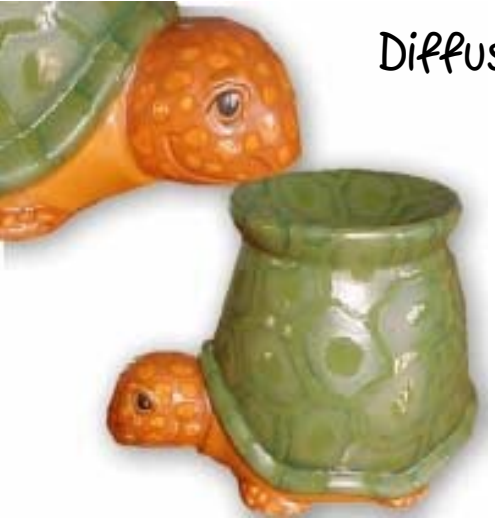
Free technique on web site for this diffusion project.