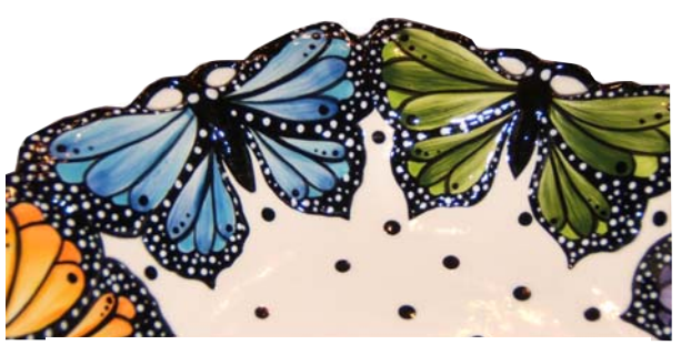
Blue Butterfly Green Butterfly