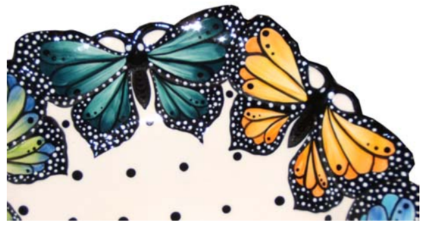
Turquoise Butterfly Yellow/Orange Butterfly