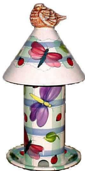
Color Strokes Airbrushed on Bisque 2 Coats of CG900 Crystal Clear Fire to 06 with 20 minute hold