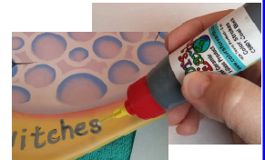
CAPKIT Accessory Kit for 1 & 2 oz. bottles