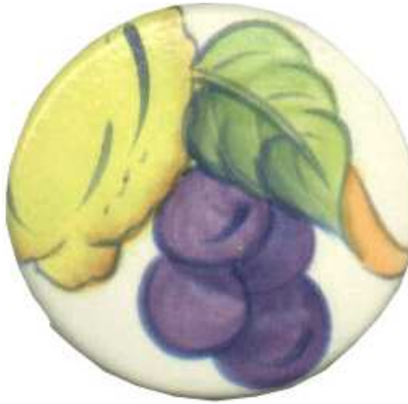
Color Strokes on Bisque 2 Coats of CG900 Crystal Clear Fire to 06 with 20 minute hold