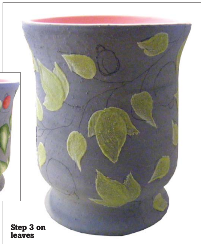
Step 3 on leaves