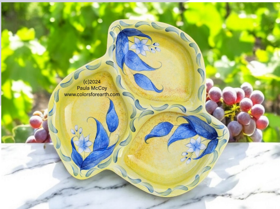
Blue version using CC102 Glacier White, CC143 Sapphire Blue and CC144 Powder Blue